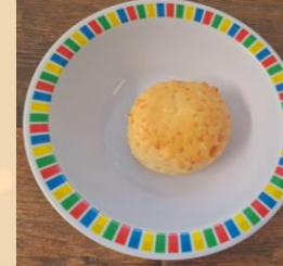
Savoury Cheese Scone