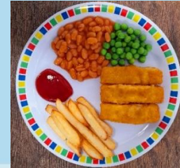
Salmon or Pollock Fish Fingers with Chips & Tomato Sauce