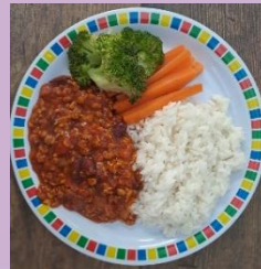
NEW Mild Mexican Chili with Rice