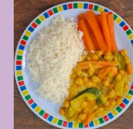
NEW Chefs Special Chickpea Curry with Rice