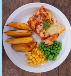
BBQ Chicken Pizza With Salads