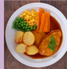
Roasted Quorn with Roast Potatoes and Gravy