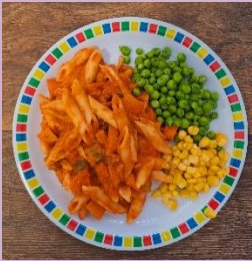
Tomato and Lentil Pasta